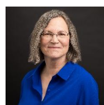
Ellen Eason Ltg Quotes & Applications